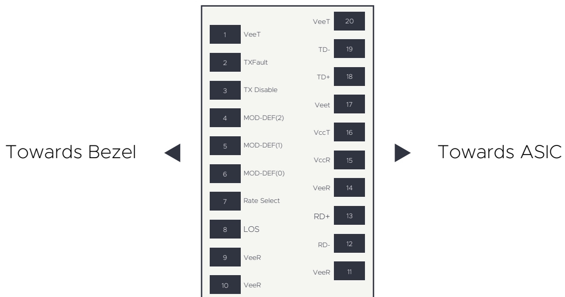
Figure 1. Diagram of host board connector block pin numbers and names