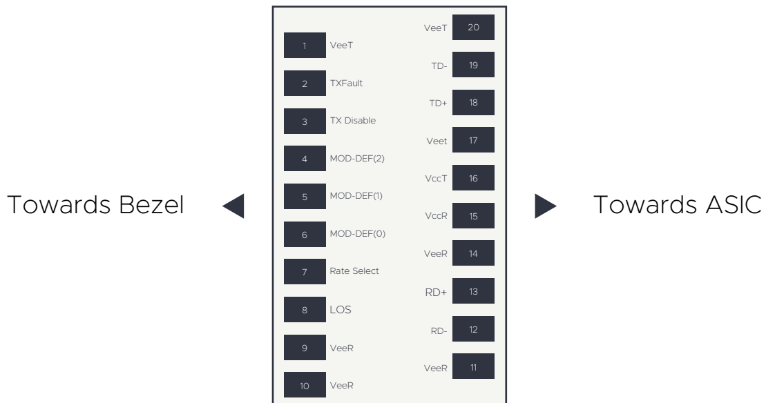
Figure 1. Diagram of host board connector block pin numbers and names