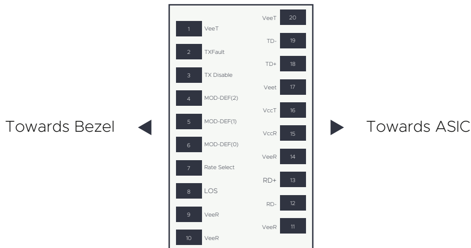
Figure 1. Diagram of host board connector block pin numbers and names