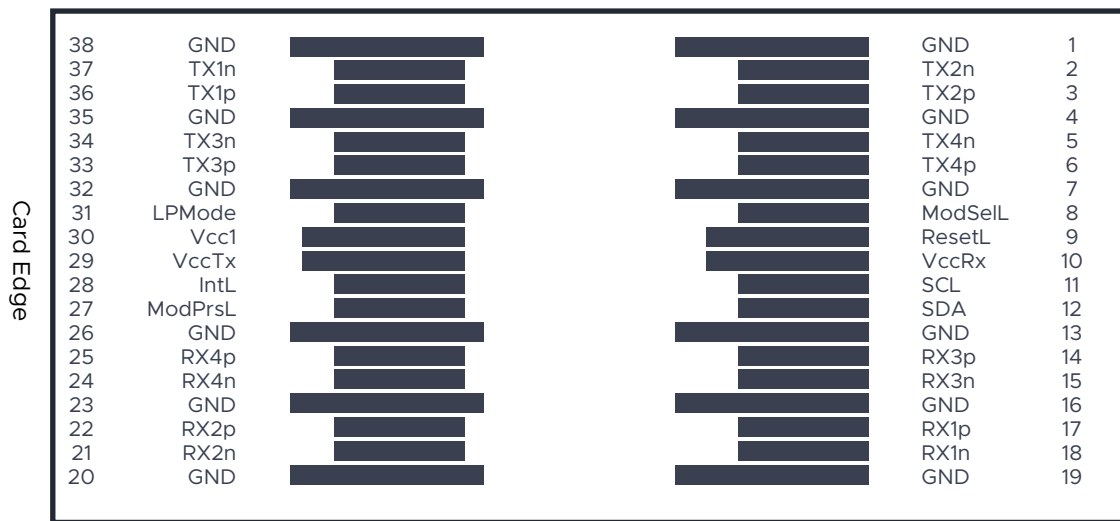
Bottom Side Viewed from Bottom