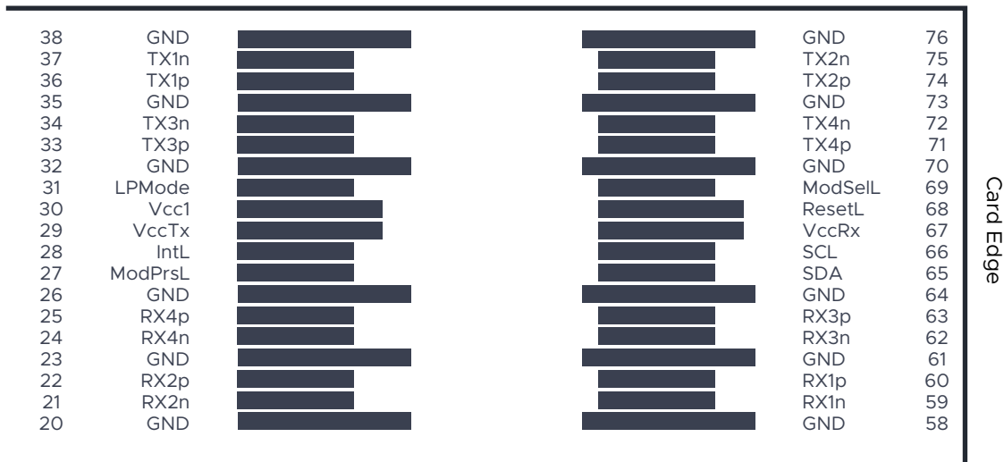
Top Side Viewed from Top