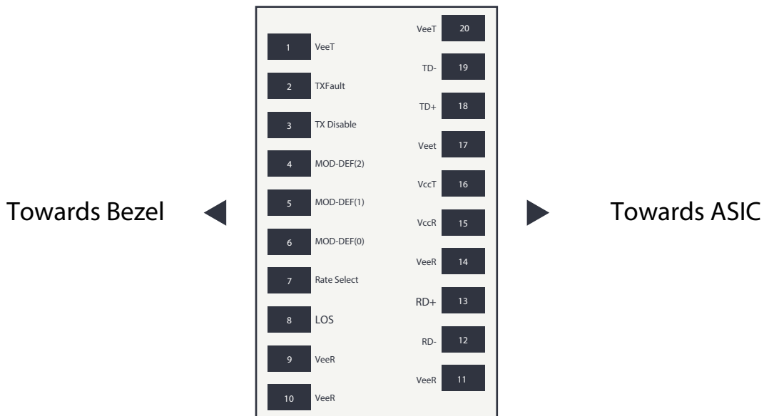
Figure 1. Diagram of host board connector block pin numbers and names