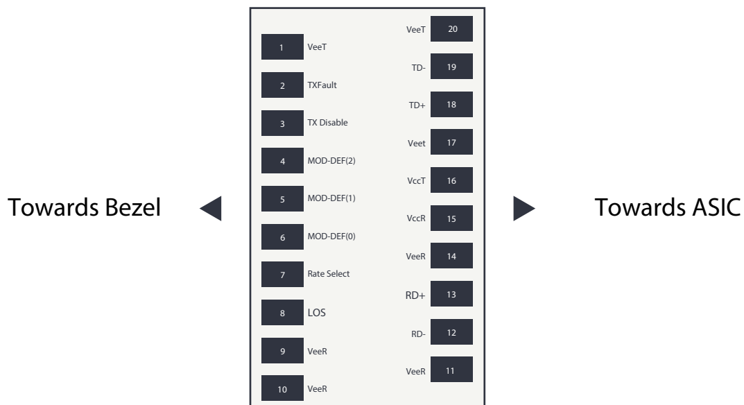
Figure 1. Diagram of host board connector block pin numbers and names