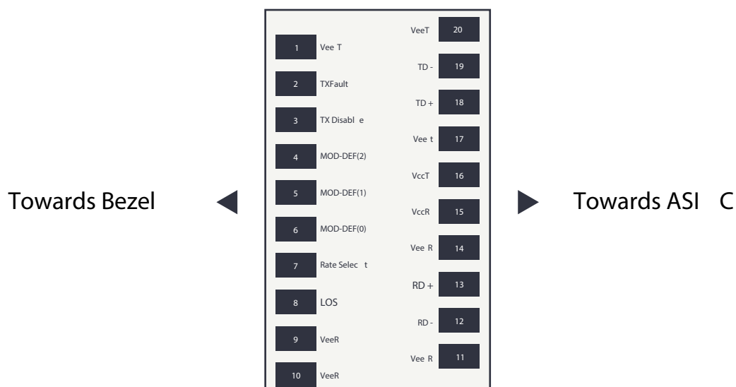
Figure 1: Diagram of host board connector block pin numbers and names