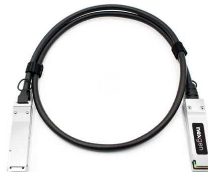
Product may differ from the picture