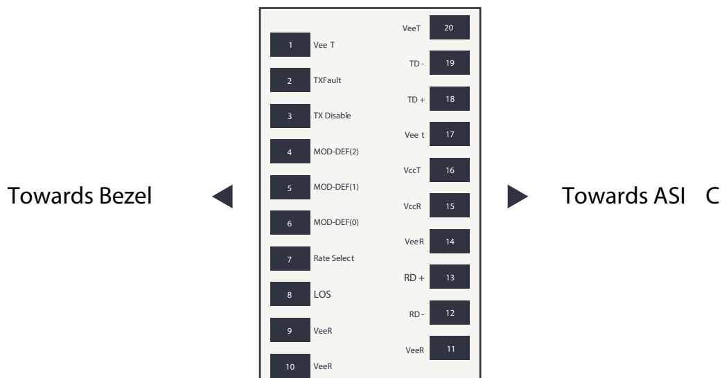
Figure 1: Diagram of host board connector block pin numbers and names